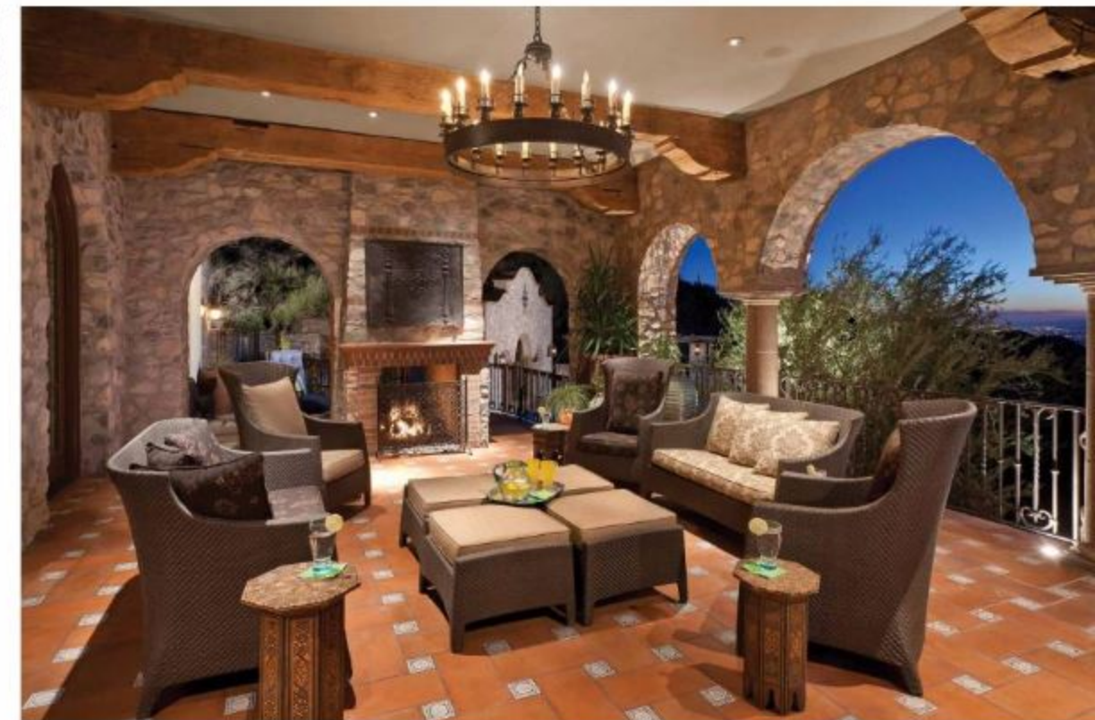
RIGHT: When possible connect a visual linkage between one space and another, like this framed view of the unique structure beyond.