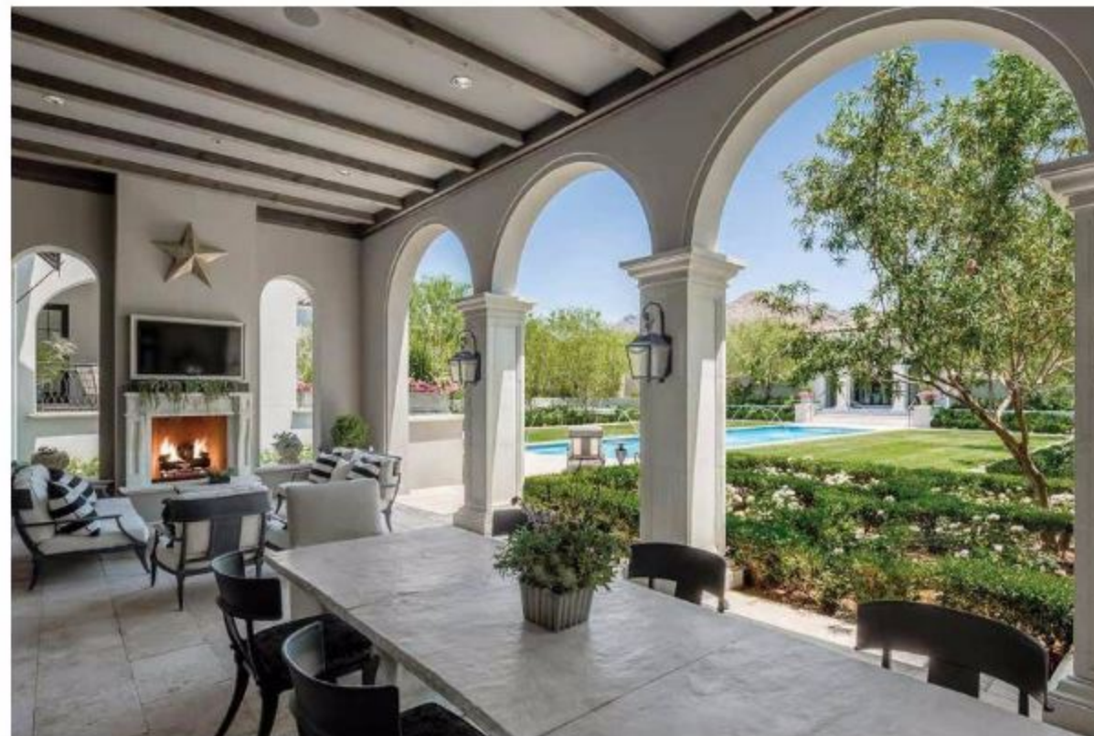
RIGHT: The same principals of open floor planning can apply to outdoor entertainment areas, where the Dining areas can be directly adjacent to the Outdoor Living areas.