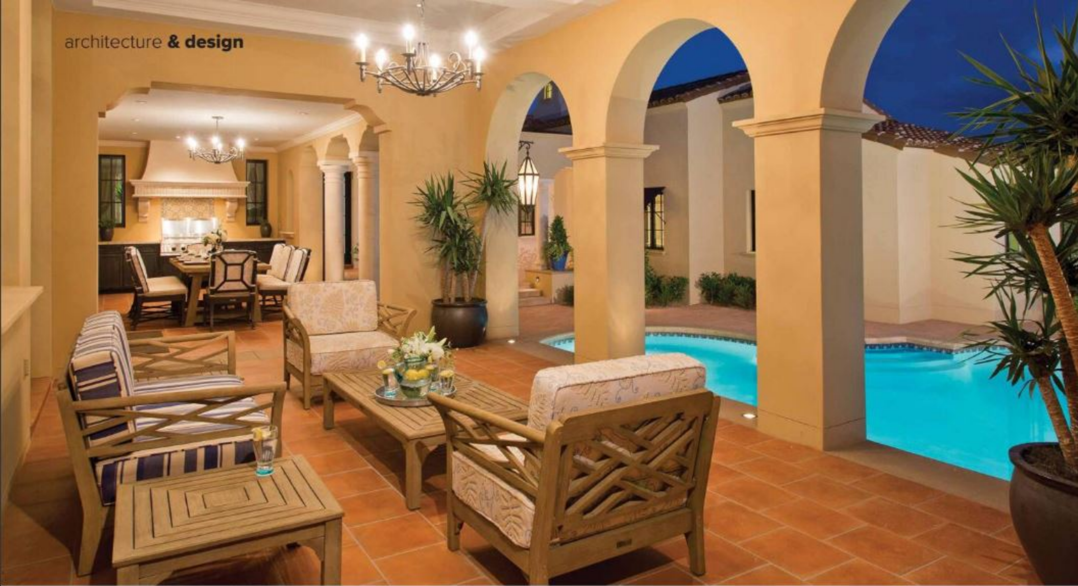
ABOVE: Bring the water elements right up to the Outdoor Living for a dramatic interplay of the water with the Architecture.