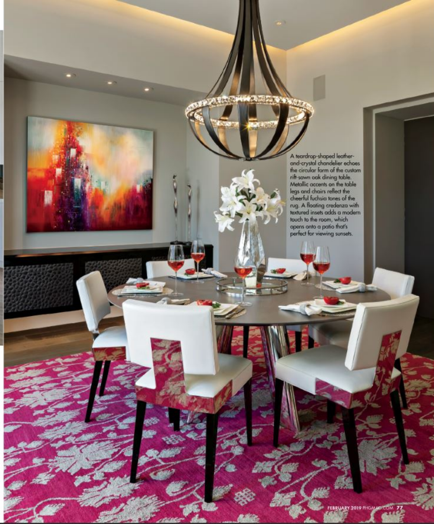
A teardrop-shaped leather-and-crystal chandelier echoes the circular form of the custom rift-sawn oak dining table. Metallic accents on the table legs and chairs reflect the cheerful fuchsia tones of the rug. A floating credenza with textured insets adds a modern touch to the room, which opens onto a patio that's perfect for viewing sunsets.

Special touches add to the home's affable character. In the kitchen, what appears to be a set of pantry doors opens up to reveal the