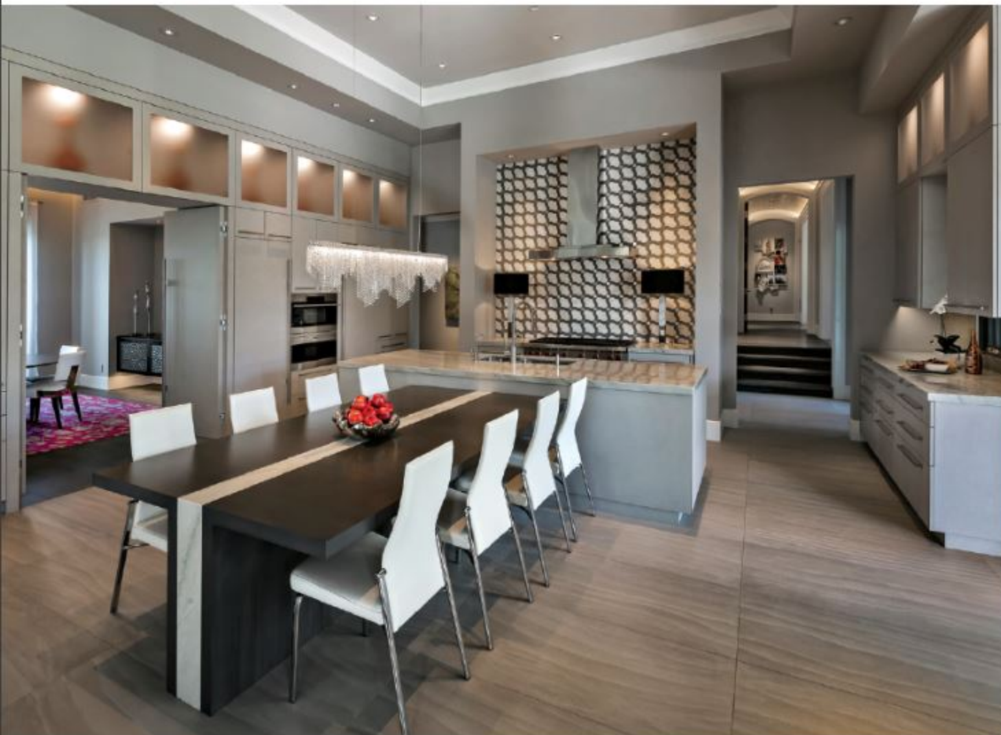
A custom alder and quartzite table provides plenty of seating in the kitchen, which was designed to look like an extension of the adjacent living room. When closed, the doors to the dining room appear to be part of the kitchen cabinetry, creating a "secret room" that the homeowners desired.

interior, so we decided to work with neutral backdrops and put the color into the art and accessories."