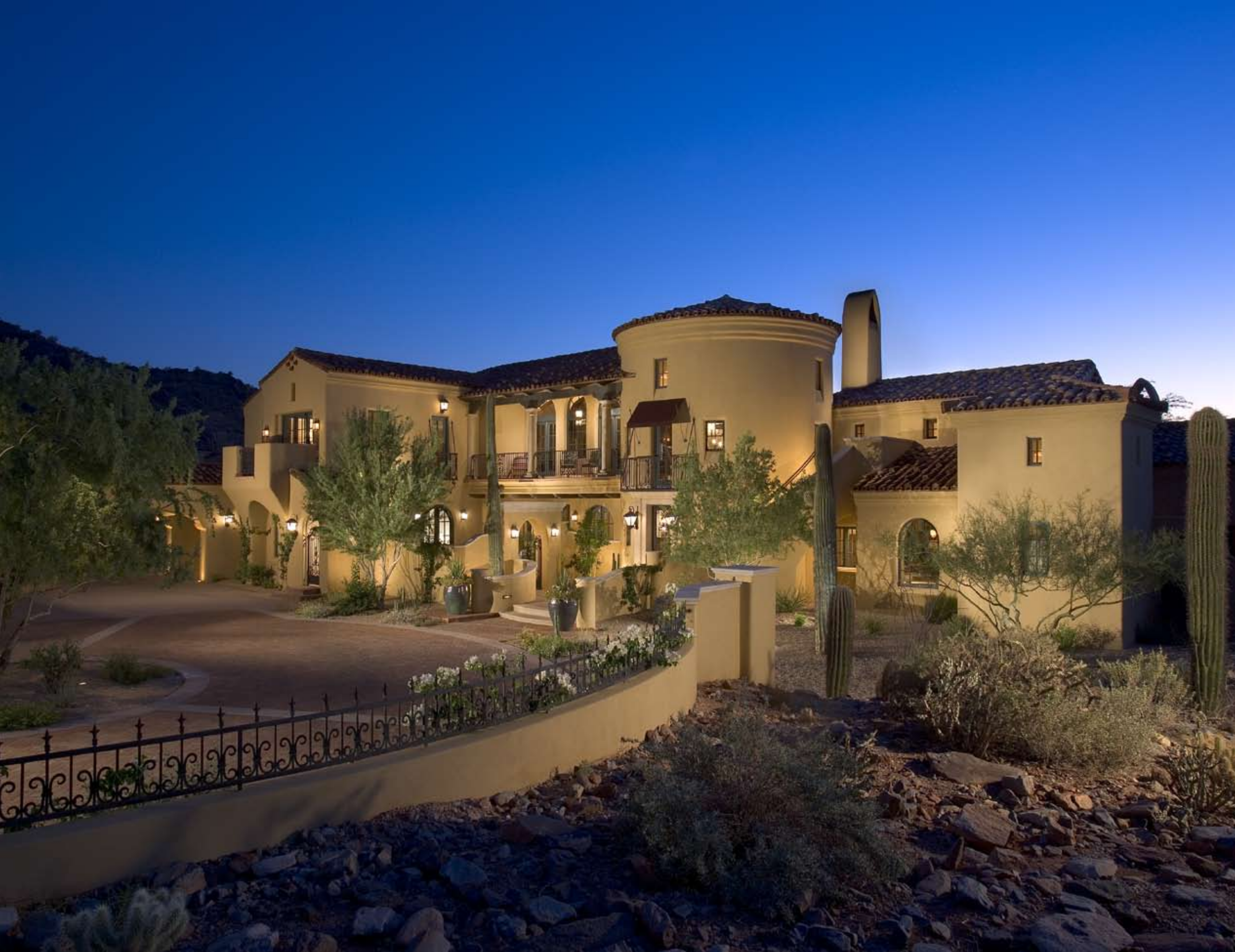
RIGHT: The hearth kitchen of this Rural Mediterranean Home, also in Silverleaf, is the central Gathering Room for formal and informal dining, exuding charm and expressing the casual lifestyle of the owners. Construction by Salcito Custom Homes Ltd. FACING PAGE: This Spanish Colonial estate home in the Silverleaf community of north Scottsdale welcomes guests with its hand-laid brick driveway, generous balconies and grand entry. Construction by Salcito Custom Homes Ltd.